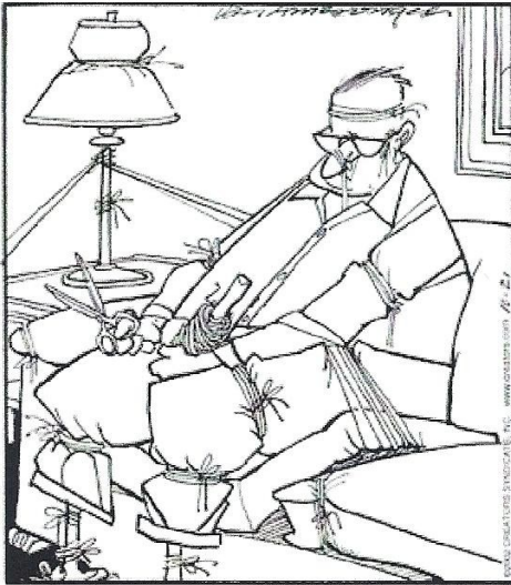
Ted's getting frantic for some sort of "self-management" impulse.

Copyright © 2002 Creators Syndicate, Inc.