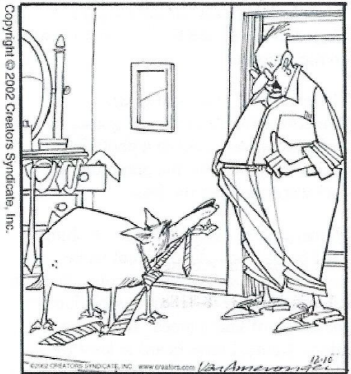
"Yes, but is it a Windsor knot?!"